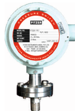
FITZER / PS / FLP 800 FLAMEPROOF PRESSURE SWITCH BLIND OR INTERNAL RANGE SCALE TYPE UP TO 160 KG / Cm²