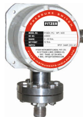
FITZER / PS / WP 600 WEATHERPROOF PRESSURE SWITCH BLIND TYPE RANGE UP TO 160 KG / Cm²