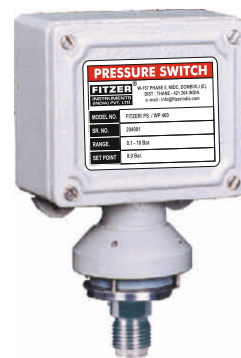
FITZER / PS / WP 400 WEATHERPROOF PRESSURE SWITCH BLIND TYPE RANGE UP TO 40 KG / Cm²